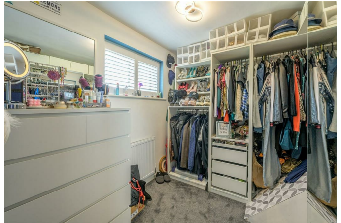
Walk-in Wardrobe / Dressing Room 8'2" x 7'7" (2.51 x 2.33)

With a door leading from the master suite, a double glazed window to the front and a central heating radiator