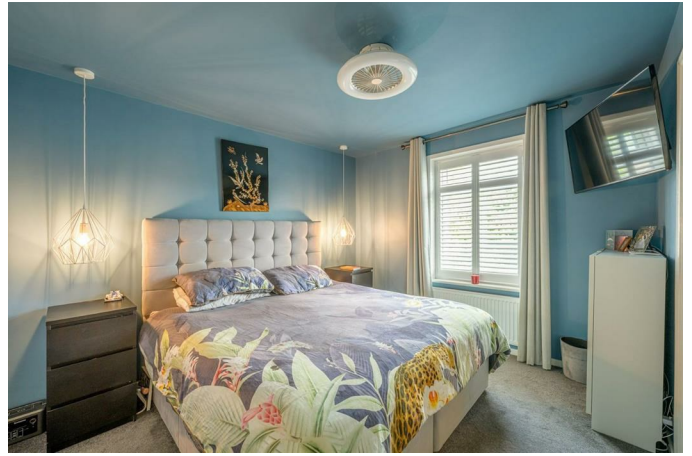
Master Suite 9'10" x 11'3" (3.00 x 3.45)

With a door leading from the landing, doors leading to the en-suite and walk-in wardrobe, a double glazed window to the front and a central heating radiator