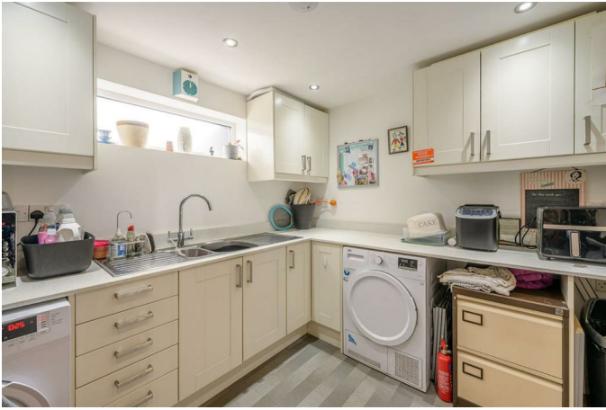
Utility 8'4" x 9'3" (2.55 x 2.83)

With a door leading from the kitchen, fitted with a range of wall and base units with worktops, stainless steel one-and-a-half sink with drainer, laundry machinery outlet points, a double glazed window to the side and a wall mounted room heater